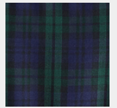
Classic Navy - Evergreen Plaid