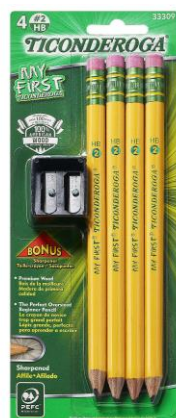
"My First" Pencils