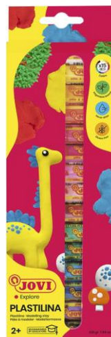
Jovi Modeling Clay Can be purchased on Amazon