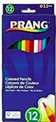
Prang Colored Pencils